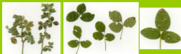
Other rusts observed on: Medicago lupulina (uredinia), Vigna luteola (uredinia) and Desmosium spp (acedidia)