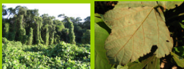
Fig. 3 and 4. Invading Kudzu with ASR in Loreto's Rain forest, Misiones province during september 2004.

Until now, kudzu, Pueraria lobata (Willd.) Ohwi (Fig. 3 and 4) and the soybean volunteer plants ( Glycine max L.) Merril are only the two species known as hosts of P. pachyrhizi in this country.