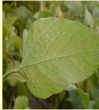
Fig. 1 Symptoms on soybean leaf