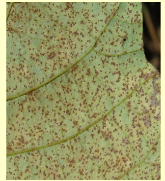
Fig. 2 Symptoms on Kudzu