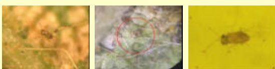
Fig. 2. Small wasps (Hymenoptera) and small wasps eclosed puparium.