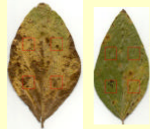
Fig. 3. A frame of 1cm 2 placed in four equidistant positions over the leaflets. The density of leaflet 34 has 10,903 pustules (mean = 2.44) and the 39 has 102 (mean = 0.75).

Violations of assumptions for regression models were detected by an examination of residual plots as part of the PROC UNIVARIATE output, and determining the potential influence of particular observation with option INFLUENCE of PROC REG. For inferences about model parameter in model under consideration F test was used to test H 0 : with PROC REG of SAS statistical package (SAS, 1999).