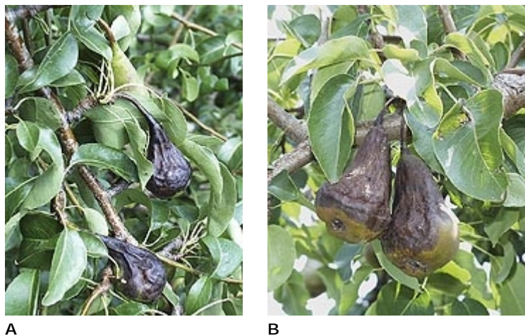
Fig. 1A and 1B. Fire blight symptoms on immature Bosc pear fruit showing infected fruit on spurs that have no symptoms of fire blight.

Several adjacent trees in Orchard 1 showed extensive fire blight symptoms on shoots on 24 July, but most trees had either no shoot blight or only a few strikes in vigorous shoots in the tops of the trees. Pear fruit with fire blight symptoms were scattered throughout the tree canopy in trees within several hundred feet of the severely affected trees. In most cases none of the subtending spur leaves showed any evidence of fire blight (Fig. 1). By July 24, most of the terminal shoots had ceased growing, and shoot blight infections in the tops of the trees were sometimes limited to the top one-third of the current season's growth as typically occurs when vegetative growth ceases and shoots become resistant to further infection and invasion by E. amylovora . The incidence of fruit infection in this orchard could not be determined because the grower had picked and destroyed infected fruit as they appeared to reduce the potential for secondary spread. On July 24, five to 10 infected fruit per tree were still evident in the trees closest to the severely infected trees that presumably supplied inoculum.