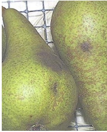
Fig. 4. Fire blight symptoms five days after immature fruit that had been preheated to 95°F were immersed in a 70°F-inoculum suspension of Erwinia amylovora .