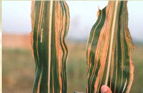
Advanced symptoms of Brown Stripe Downy Mildew.

•Oogonia are found scattered in the leaf mesophyll or the substomatal cavities, but never in the vascular bundles.